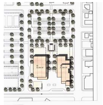
Approved lot design for the WSMB at the corner of Highway 66 and Walker Street in Ashland. JPR/WSMB is on the bottom right side of the lot.

The University will also construct appropriate parking for the facilities on the lot. The parties expect to sign these contracts before June, 2003.