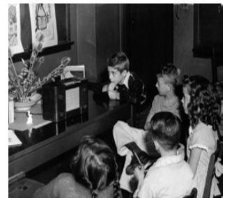
Elementary school students gathered to listen to a lesson delivered by radio in September, 1947.