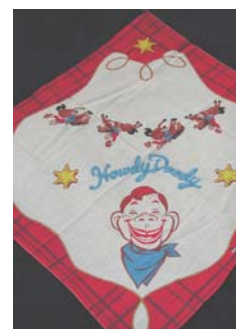
(above) Bandana c. 1988. (below) Comic book, c. 1949.

The program's famous Peanut Gallery accommodated 40 children who could sit live on the program's set and parents—from heads of state to expectant mothers—across America vied for the coveted spots. Toppled from popularity by time and the Mickey Mouse Club in 1956, the Howdy Doody cast became a "nostalgia" juggernaut in the 1970's by which time the children who grew up with the little puppet had moved on to become captains of industry—and parents!