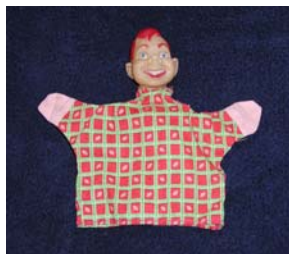
(above) A Howdy Doody hand puppet c. 1950. (below) Magic Kit, offered by sponsor Mars Candy, c. 1951.