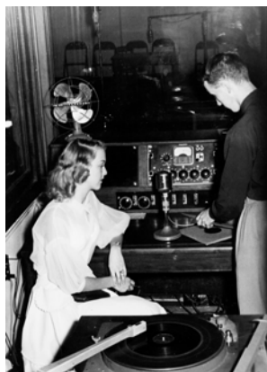
Two students in a KBPS control room in 1947

KBPS-AM (then KFIF) signed on in May, 1923 when Portland Public Schools' Benson Polytechnic High School purchased the equipment of an abandoned radio station, KYG. Renamed KBPS in 1930, the station had been acquired with student body funds as a technical training facility and to provide public service programming to Portland. KBPS was, and remains, one of the only high school owned and operated radio stations in the nation and is now one of the oldest surviving radio stations in